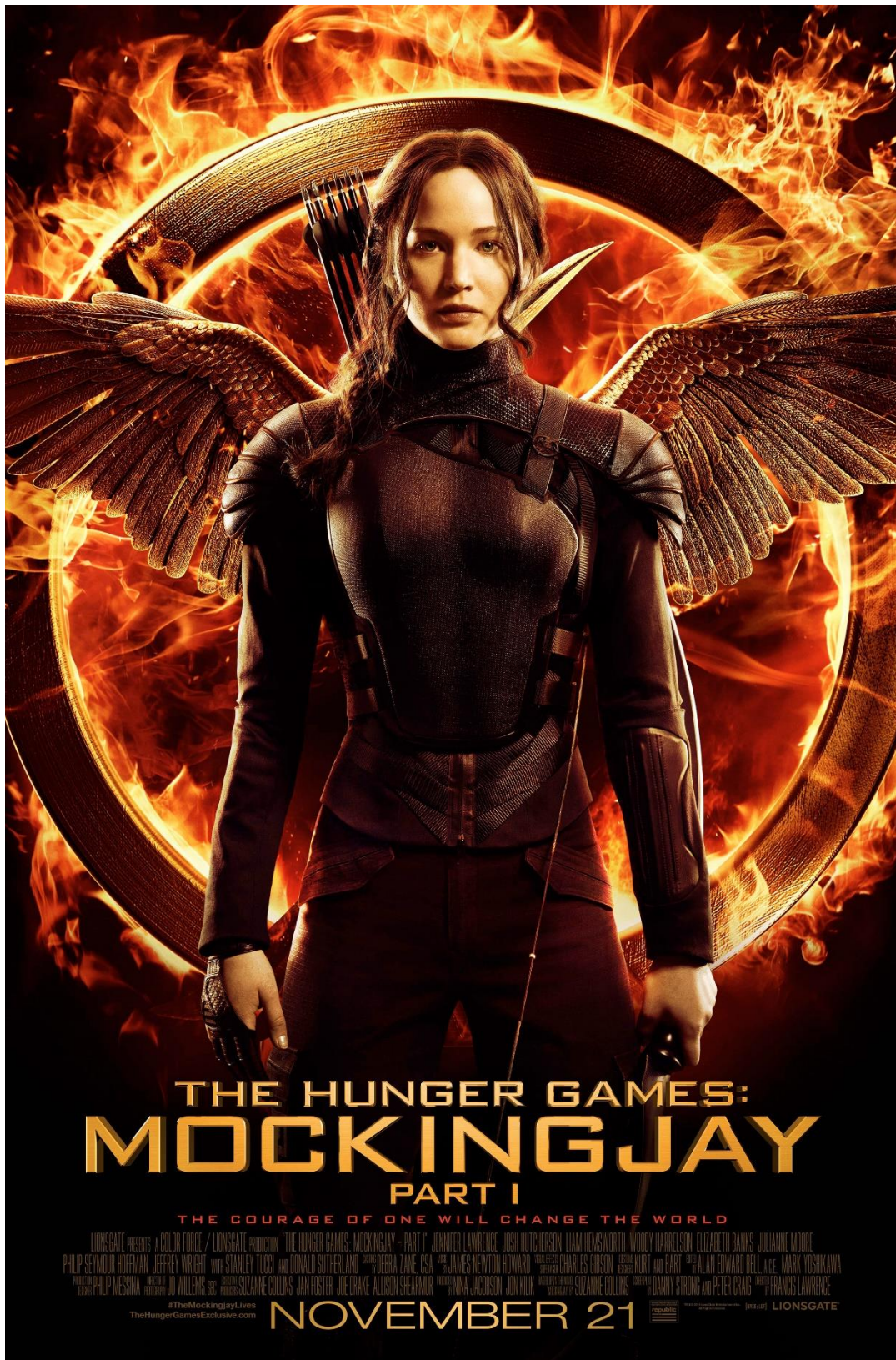
Film poster, The Hunger Games, Mockingjay, Part I , 2014