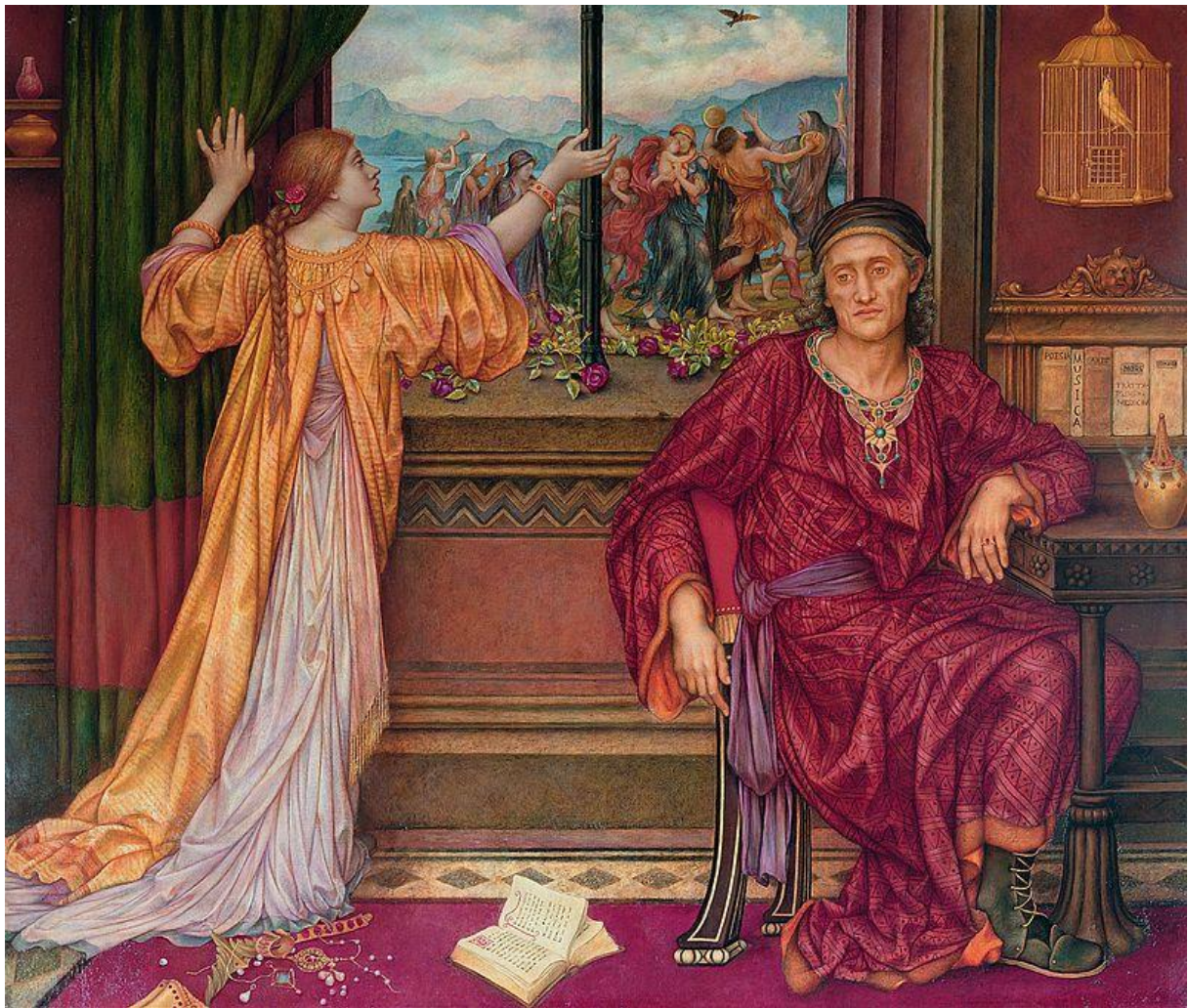
Evelyn De Morgan, The Gilded Cage , 1919, 78 cm x 1,05 m, oil on canvas, De Morgan Centre.