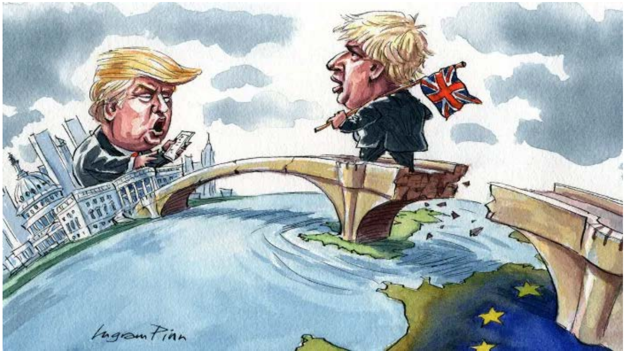
Ingram Pinn, Financial Times , January 30 th , 2020.