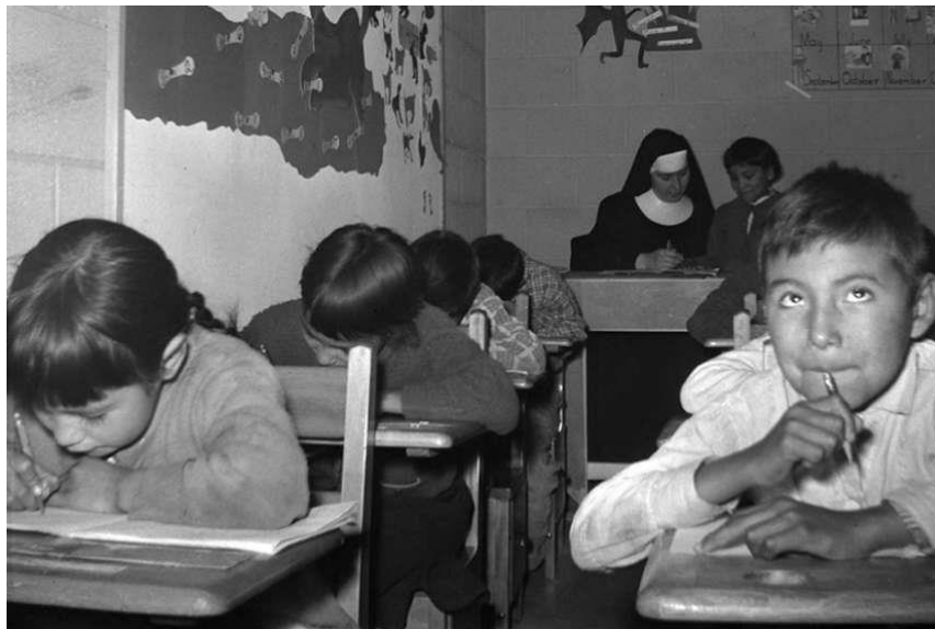
A young boy with other students and a nun in a classroom at the Pukatawagan Indian Residential School, Manitoba, circa 1960.