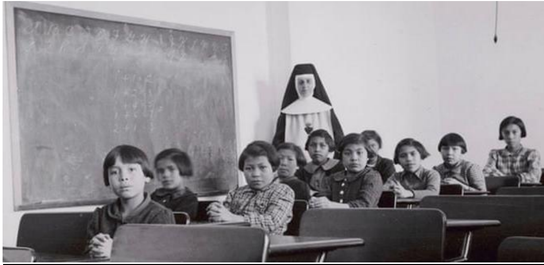
Female students and a nun pose in a classroom at Cross Lake Indian Residential School, Manitoba, February 1940 (Indian and Northern Affairs/Library and Archives Canada).