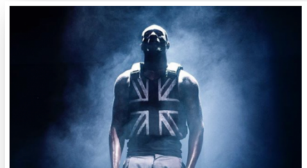
Stormzy's Stab "Proof Vest by Banksy,

Banksy has repeatedly commented on themes of violence and war. Most recently, Banksy designed a Union Jack stab-proof vest that British rapper "Stormzy" wore during his headline set at this year's Glastonbury Festival. "I made a customized stab-proof vest and thought – who could possibly wear this? Stormzy at Glastonbury," Banksy wrote in his